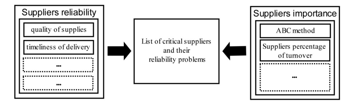
Figure 3 – Concept of the extended approach (own conception)

The presented approach can be extended in two ways. The calculation of supplier reliability can be based on more criteria than two. Expanding the number of criteria can refine supplier reliability, and it will expand the number of dimensions of the decision matrix and the number of quadrants. Therefore, the graphical expression of the decision matrix can be more difficult, but with the use of the presented software tool this is not a problem. New criterion for supplier reliability for example can be satisfaction of the organisation with supplier cooperation. It can be expressed by the proportion of accepted complaints. Other criteria and measures can be found, for example, in the appendix of the literature review paper (Ho, et al., 2010) and (Zgodavova, 2003:59-57).